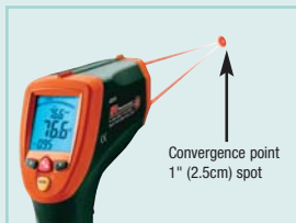
Two laser points converge at a distance of 50"/127cm and form a 1" (2.5cm) spot.