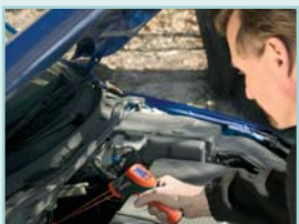
Max hold indicates and holds the peak temperature for easy identification of hot spots