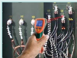
Fast response captures hot spots